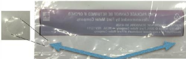
2 air evacuation holes