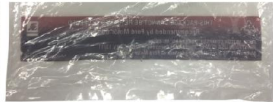
No air evacuation holes